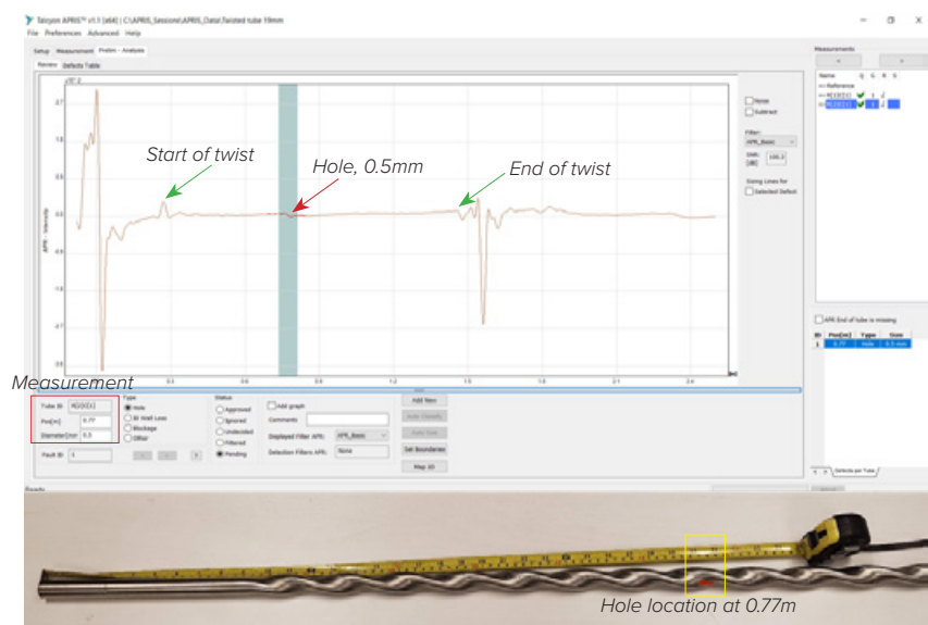
Figure 3: Hole location and sizing.

On comparing the two signals, an anomaly can be seen as show on Figure 2 above. Using the APRIS Fullcheck software, the located of the anomaly was found at the position 0.77m from the start of the tube, and the anomaly is identified as a hole with size 0.5 mm (Figure 3).