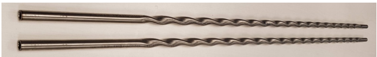
Figure 1: Two twisted tubes

Acoustic Pulse Reflectometry Inspection System (APRIS) can identify blockages and holes in a tube regardless of tube configuration and material. It is quick, as it takes only 10 seconds per tube for measurement and can give the location and size of the defects.